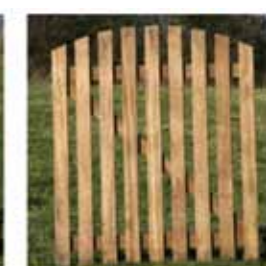
Hardwood Dome Top