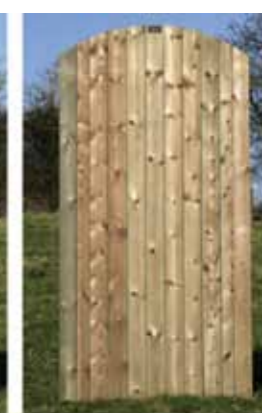
Dome Top Tongue and Groove