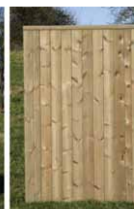
Flat Top Tongue and Groove