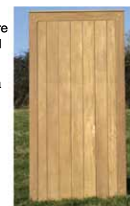
Hardwood Tongue and Groove

Gates are pressure treated with Tanalith E in a natural wood green.